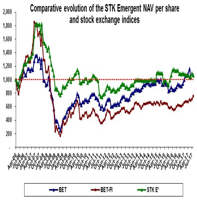
STK E*- NAV per share adjusted for dividends

Comparative chart of STK Emergent and the Bucharest Stock Exchange Indices between start-up and August 2017: